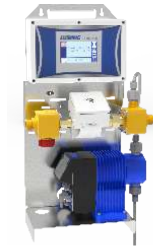
Electrical Doser 24 V Item no. 4283

With the electric doser 24 V, we have expanded our dosing range for use in mobile stalls. With this we make it possible to directly use the often self-sufficient power supply with 24 V DC. The doser can also be used for the often used water tanks with low water pressure and small amounts of water. With the stepper motor pump used, extremely precise dosing quantities are achieved. With this dosing technology, we also achieve a very high degree of mixing, which is particularly important when smaller quantities of water are purchased.