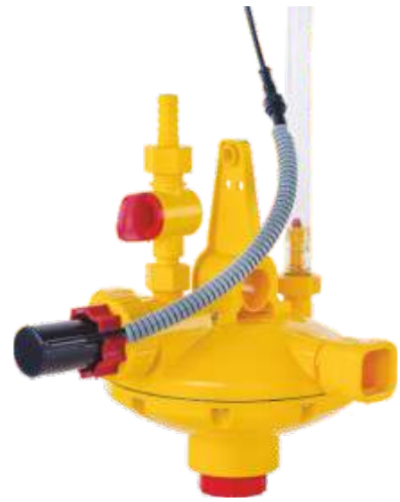
With actuator for automatic flushing

Optional screw-in actuators for automatic flushing: The LUBING flush control „LCW Touch Control“ sequentially switches the actuators which open the integrated flush valve of the Optima E-Flush pressure regulator. The required voltage is provided by the LCW control in 24 V DC. The cable length of the actuators of 7,5 m ensures flexible handling. Manual flushing remains possible even with actuator.