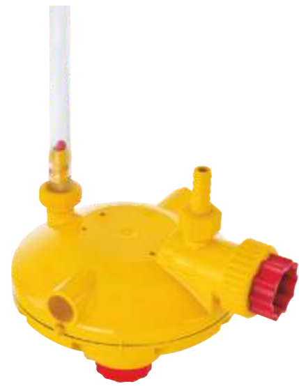
Without actuator, manual flushing