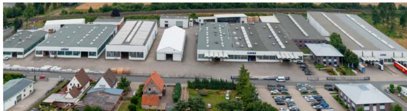
The headquarters in Lubingstraße in Barnstorf.

LUBING is constantly and steadily expanding. Stable economic development, consistent and continuous further development of all products and an uncompromising quality philosophy from production to service are the foundations of our success.