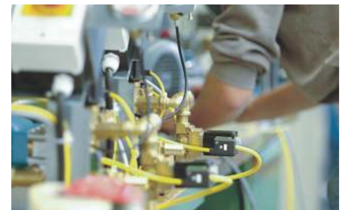
Technology in perfection.