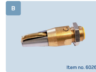
LUBING Piglet nipple with brass housing

Art. 6006 (1/2") and 6008 (3/4") for sows, breeding and fattening pigs with brass housing and stainless steel point. The flow rate can be regulated from the outside by adjusting screw.