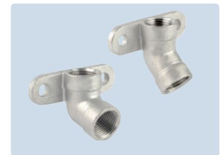
LUBING Stainless Steel brackets

The sturdy nipple with 1/2" male thread Art. 6132-5 deliver the high water quantities required. The flow rate can be adjusted with the perforated disc.