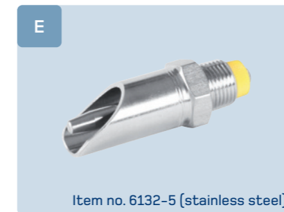
LUBING drinking nipple for boars and sows

The easy and trouble-free operation ensures a good water supply to the piglets. Art. 6130-5 with external hexagon. The flow rate can be adjusted with the perforated disc.