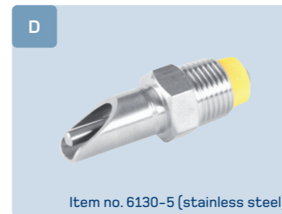
LUBING piglet nipple for rearing and pre-fattening

Art. 6006-2 / 6026-2 (1/2") for sows, breeding and fattening pigs and piglets. The flow rate can be regulated from the outside by adjusting screw.