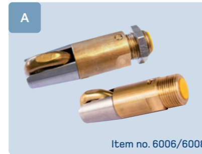
LUBING Pig nipple with brass housing

Art. 6006 (1/2") and 6008 (3/4") for sows, breeding and fattening pigs with brass housing and stainless steel point. The flow rate can be regulated from the outside by adjusting screw.