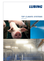
Top-Climate-Systems for pigs