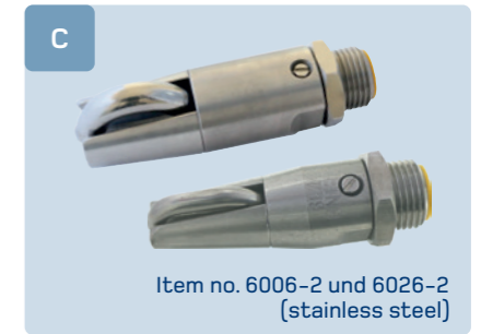
NEW LUBING stainless steel biting nipple

The piglet nipple Art.6026 (1/2") with brass housing and stainless steel point. The flow rate can be regulated from outside with an adjusting screw.